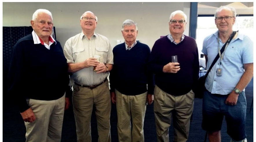
A gathering of Past Presidents at lunch

Member's contributions to the Bulletin are always welcome. The greater number of guest reporters the more varied and interesting the Bulletin content can be.