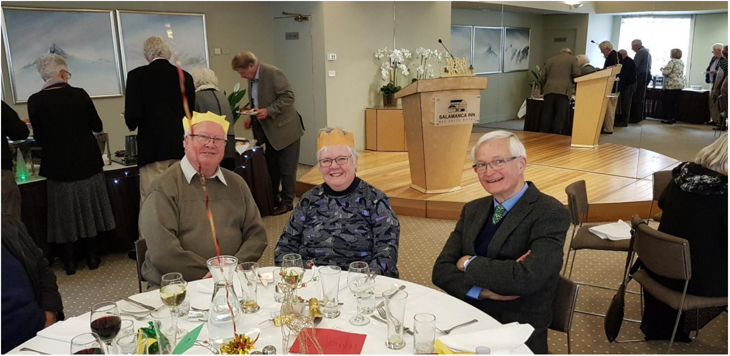
The Ausmas function was an enjoyable occasion for a lively crowd