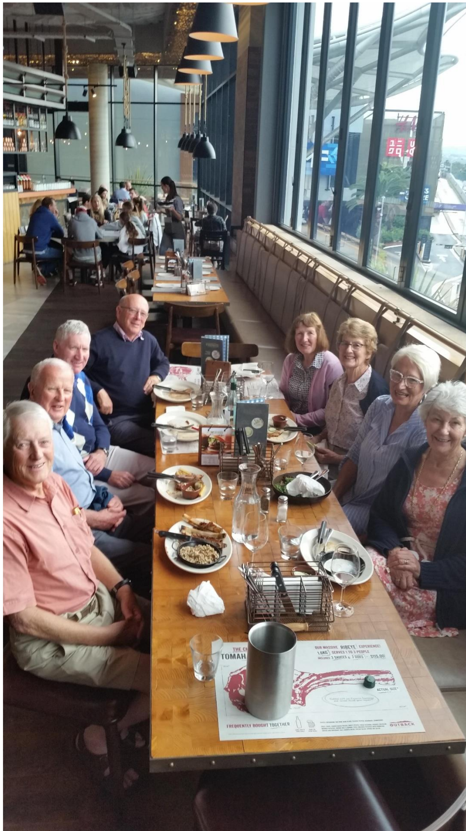
A happy group of holiday makers at Pacific Fair, Broadbeach.