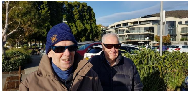
Photo Gallery: this month we feature the Wednesday Walkers. Member's contribution of any Probus related photos for inclusion in this gallery would be appreciated.