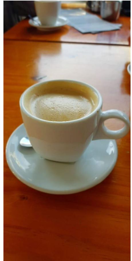
And, of course, COFFEE.