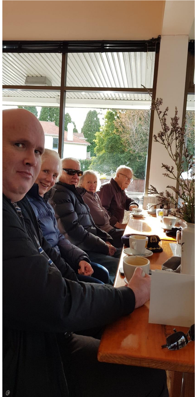
A beach walk for some, shorter for others, and then conviviality