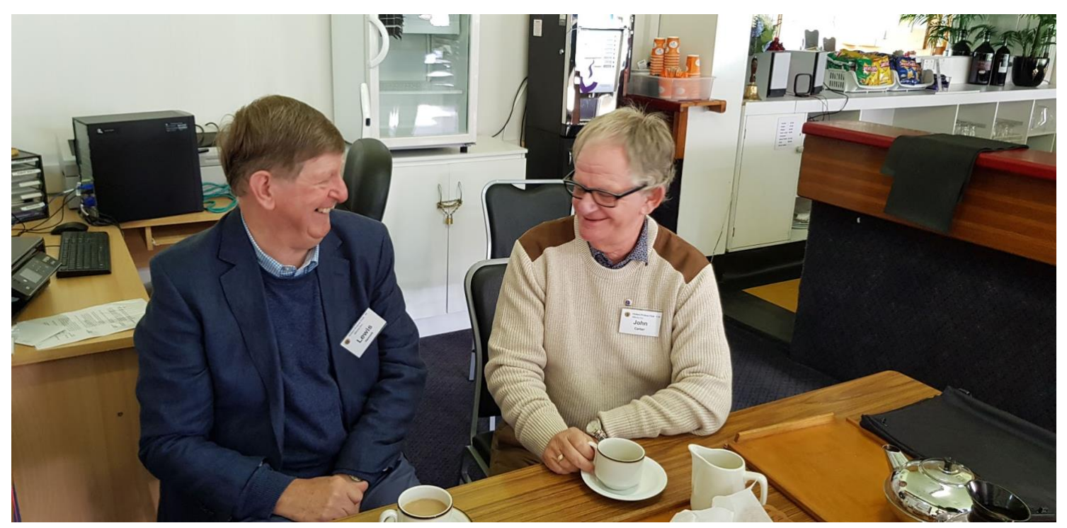
Clearly up to no good!