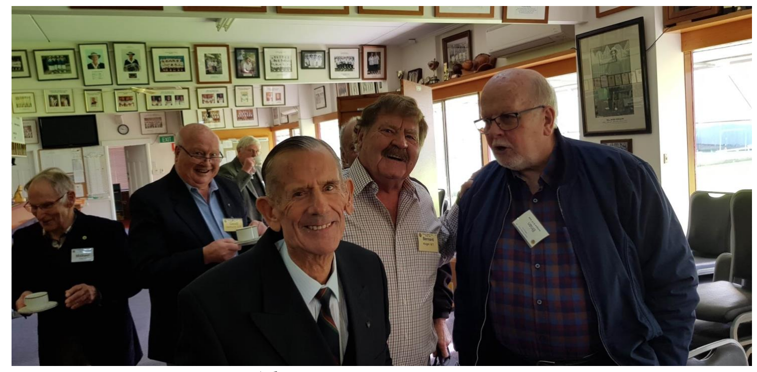
A happy group