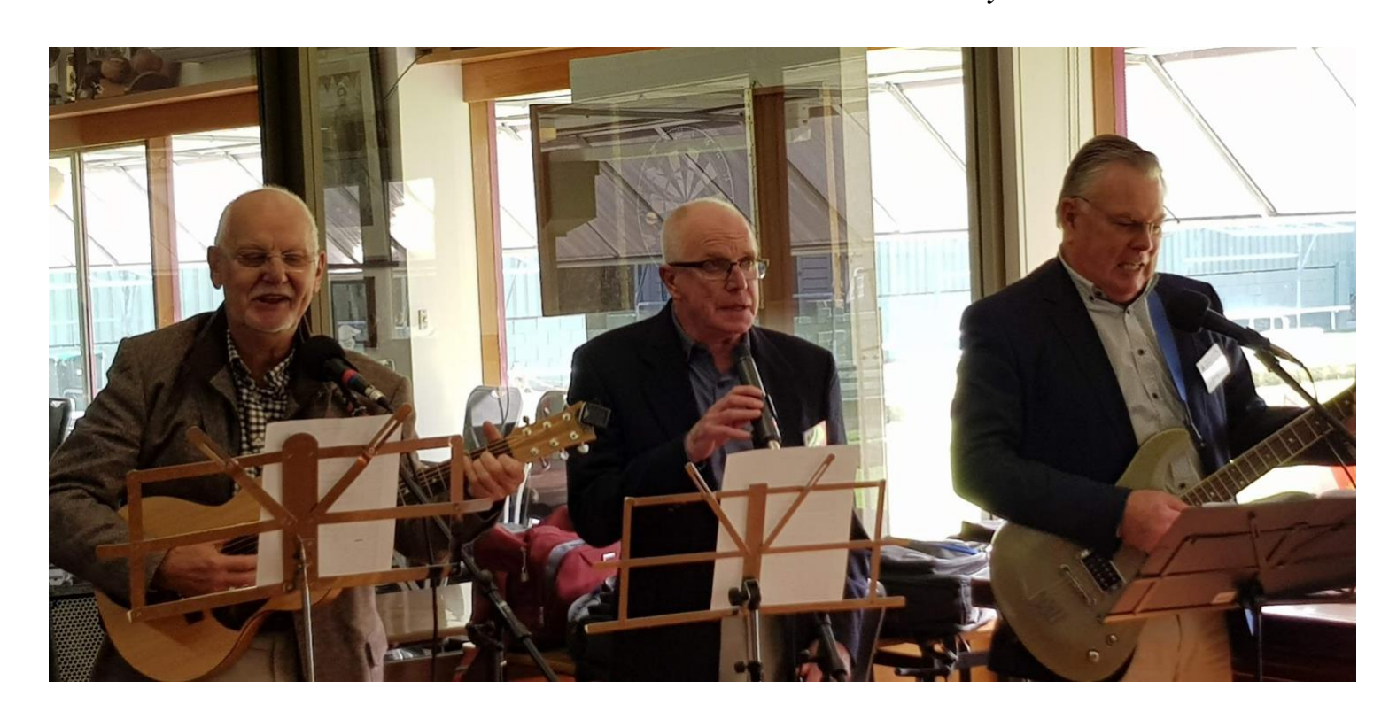
A happy group at Willie Smiths