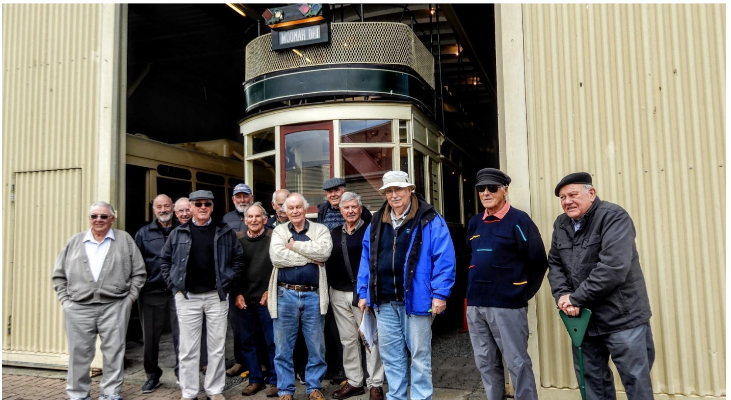
The crew at the Transport Museum, Glenorchy