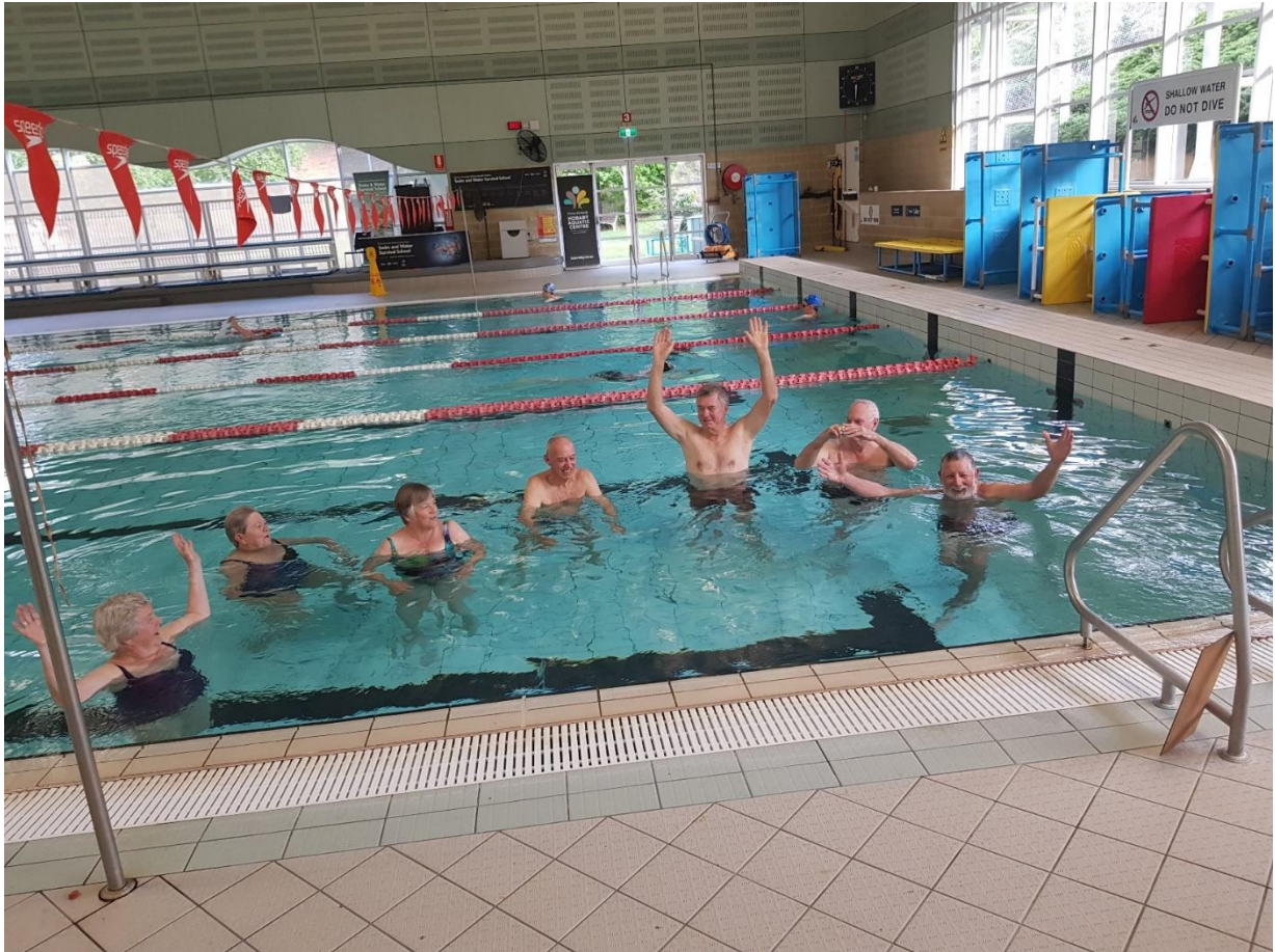
Fun at Aquarobics

More photos can be seen on the club website on the Galleries page.