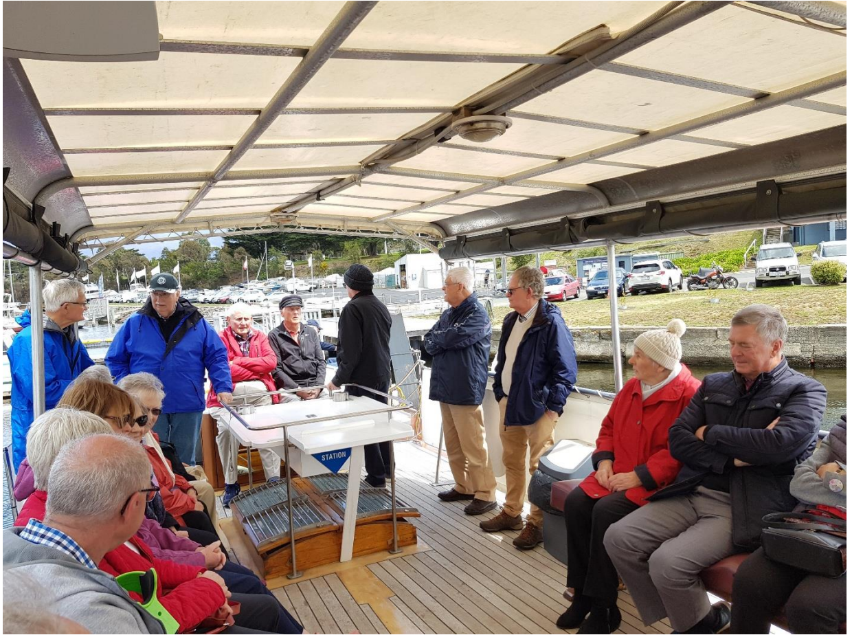
More pictures can be viewed on the club website at www.hobartmensprobus.org