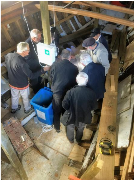
Incredible Hulks inspecting the incredible hulk (Mistral 11)