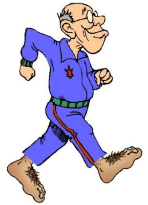
Western Shore Walker