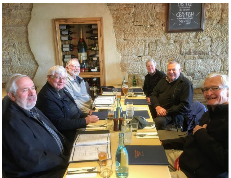
Landlubbers at Lunch