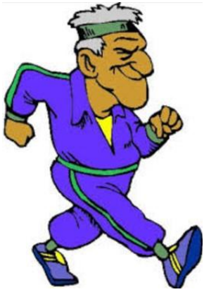
Eastern Shore Walker

We walk from different venues ( eastern shore on Mondays and western shore on Thursdays ) as per the schedule sent to all members on 4/3/21. Contact Ian Miller (0407686447) or Brian Butler (0409218567) for the meeting point at 9.30 a.m.