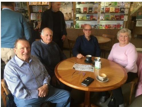
Potential Probus Member

A sociable lunch was held in the museum café, after the tour.