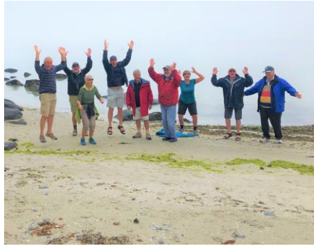
Leaping Lads and Ladies