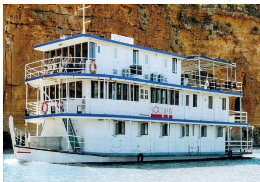
Proud Mary on the Murray