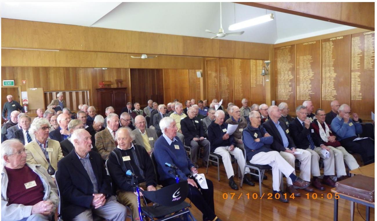
Attendees at last month's (October ) meeting