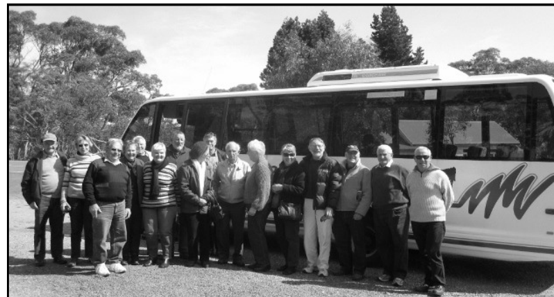
Members who went along on the Waddamana Power Station outing in October 2010

The construction site at Berriedale for MONA was an impressive event for members who had taken part in this outing in November.