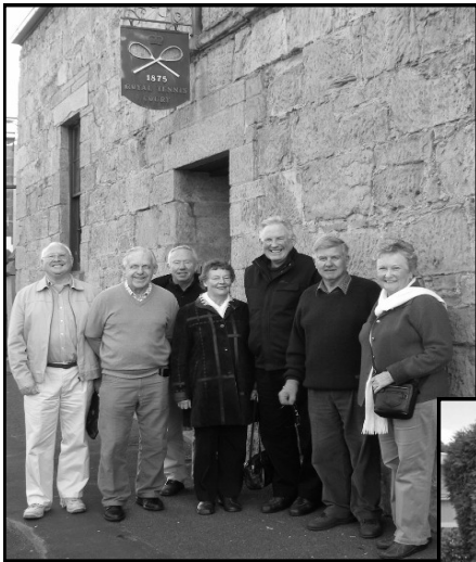
Royal Tennis Outing June 2011