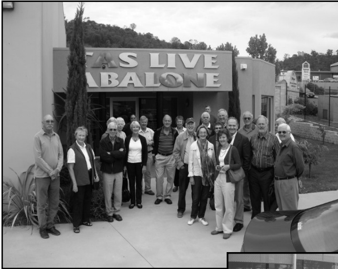
Abalone Factory Outing March - 2011