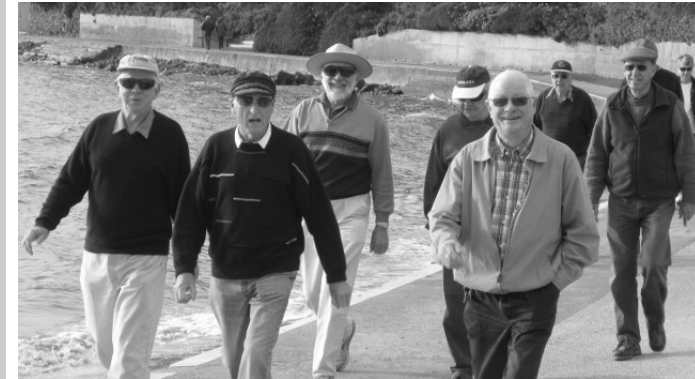
Each Wednesday morning members and their partners enjoy a beach-side walk followed by a cup of coffee at a nearby restaurant