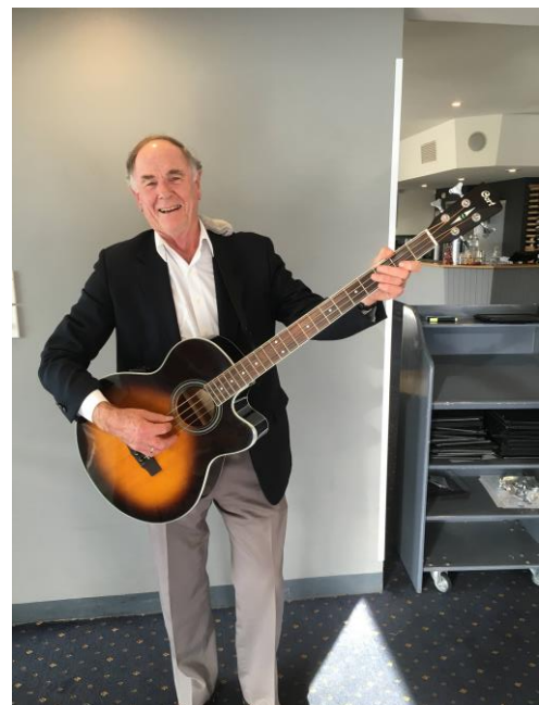
Hey Mister Bass Man!