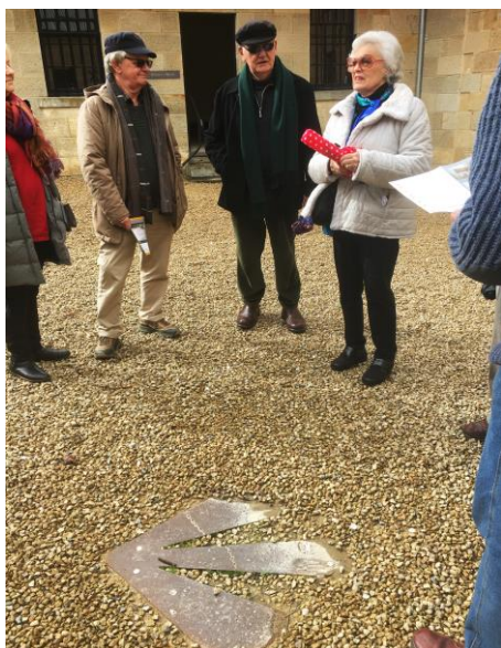
Does anyone know where to from here?

We had a strong attendance of history aficionados at our August outing to the Richmond Gaol.