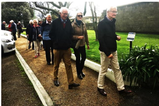
The long march to the cells!