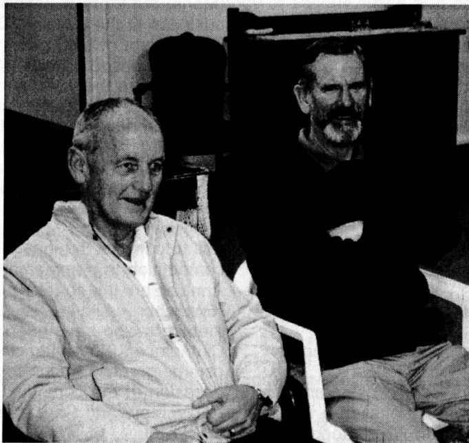
Relaxing after Aquarobics - 2002