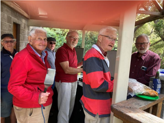
Jostling for the hotplate

Sausage sizzlers were in abundance at the annual Waterworks Barbeque. The day was warm, and the rissoles were hot.