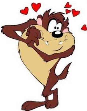
We all love NW Tassie

They say tourists see more of their state than the inhabitants. So, why not become a tourist and join the planned tour to explore the delights of North West Tasmania.