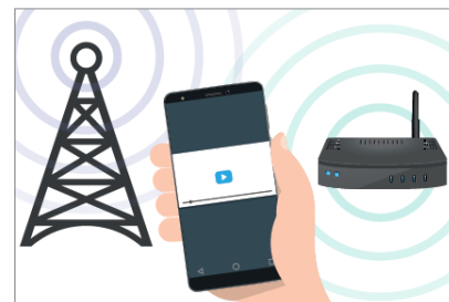
Home and mobile data come from different places