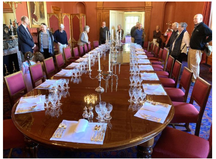
Luncheon for us? How thoughtful!

On a wild and windy day an enthusiastic bunch of Probarians, and their partners, blew into Government House to tour the extensive gardens, only to find the tour had been cancelled due to the dangers posed by the gale force winds.