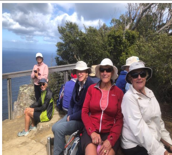
Hair Shirts on route to Cape Raoul

Walkers on the Wednesday were divided into two groups, The 'Hair Shirts' who took on the gruelling five hour walk to Cape Raoul and the 'Sensible Sedentaries' who plodded along the beach as usual.