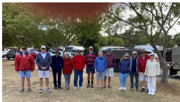
The 'Sensible Sedentaries'

There was a combination of well attended organised activities with ample free time to relax and do your own thing.