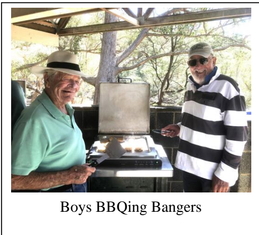
Boys BBQing Bangers

A large group of hungry sausage sizzlers gathered at the Waterworks reserve for the annual Probus BBQ on Monday 26 February.